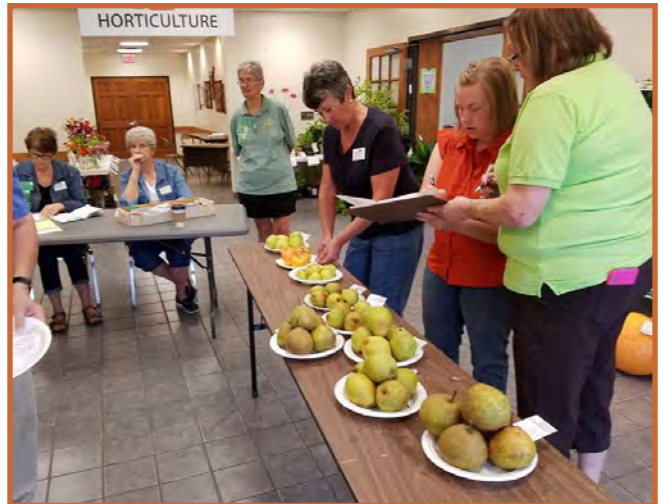
Above, CCMGA members assist in checking in exhibits at the County Fair.

From work at the Cleveland County Fair, to presenting a variety of classes, to tending a beautiful Teaching and Demonstration Gardens, to attending the Monarch Butterfly Festival in Blanchard, Master Gardeners in Cleveland County have been productive and very busy this summer.